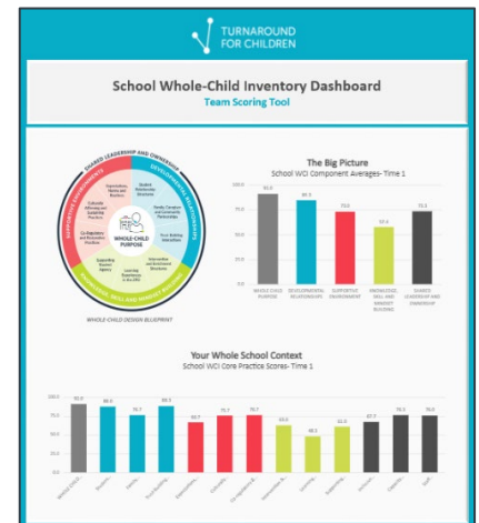
Sample Team Scoring Tool