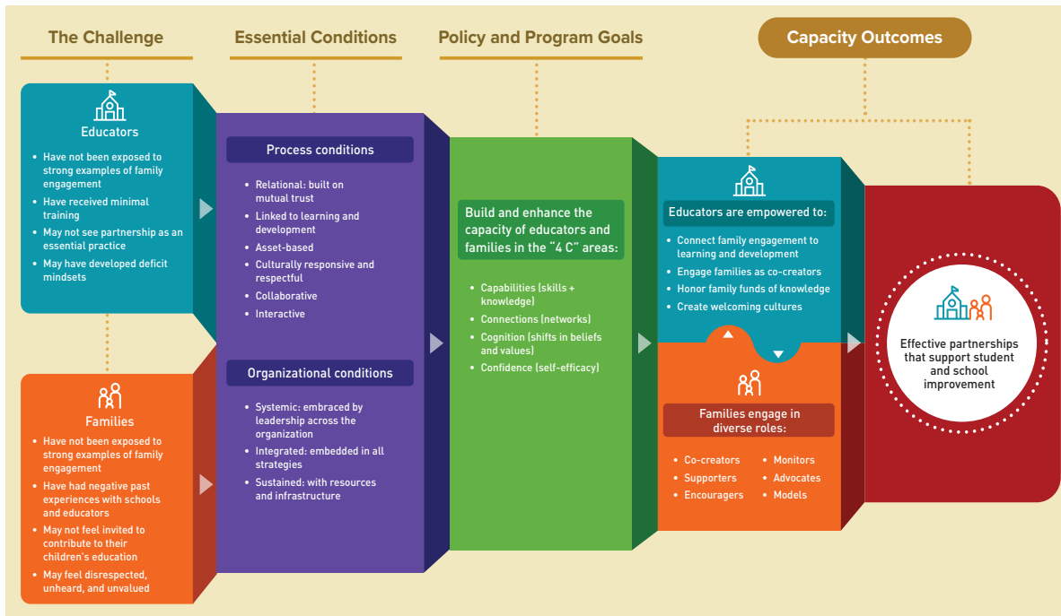
Figure 2.1 The Dual Capacity-Building Framework for Family-School Partnerships