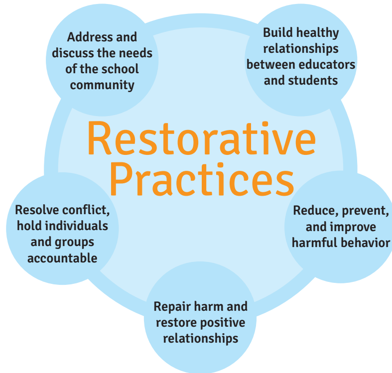
Figure 3.1 What Are Restorative Practices?