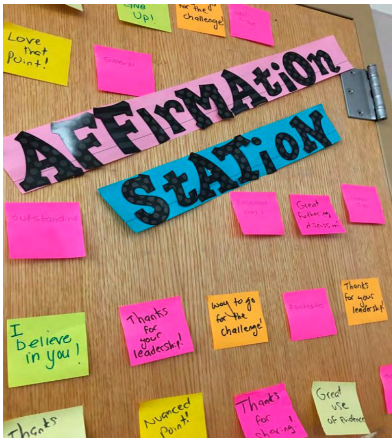
Figure 3.2 Affirmation Station at Bronxdale High School